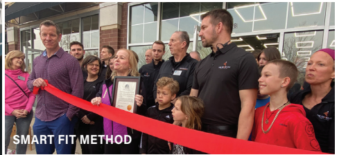
SMART FIT METHOD