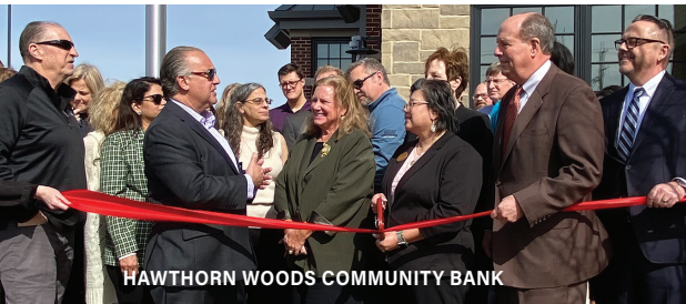
HAWTHORN WOODS COMMUNITY BANK