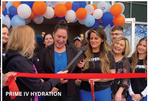
PRIME IV HYDRATION