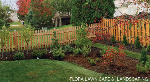
FLORA LAWN CARE & LANDSCAPING