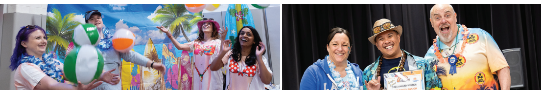
2024 Surfin' Local Community EXPO

To advertise contact the Chamber office or visit www.lzacc.com/localbvibes