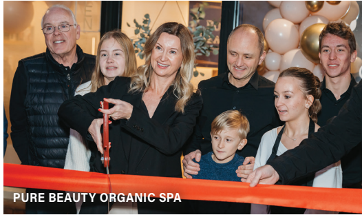
PURE BEAUTY ORGANIC SPA

The community welcomed the following new businesses to the area over the past few months.